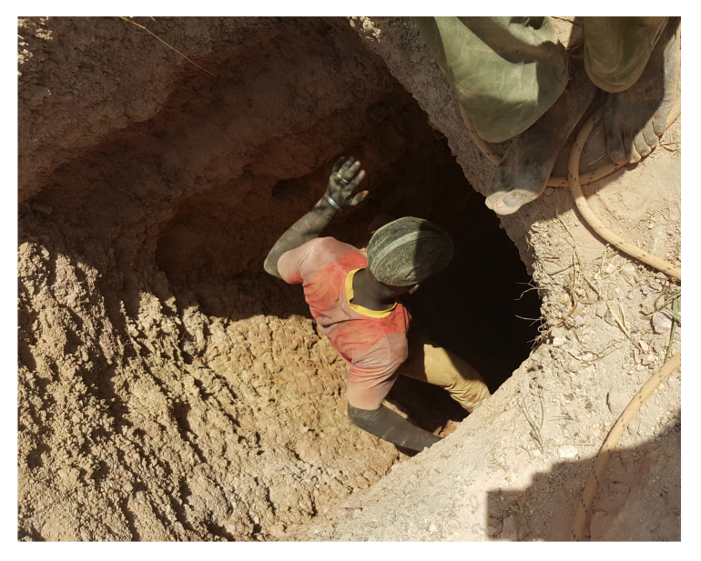
Figure 5. Photograph of a miner descending into the well.

In his experimental studies, Guha [5] showed that surgical decompression procedures made within the first 4 hours following the injury may have some improvement, but even so, the severity of the trauma is the main determinant for the prognosis. Ersmark [6] stated that there is no correlation between the method of treatment and the outcome. According to Bedbrook [7], improvement in the neurological status is the result of long term sensorial stimulation and isometric muscle exercises. The majority of our patients had been admitted with paraplegia or tetraplegia, several days or weeks after their trauma. Their chance of recovery was very small.